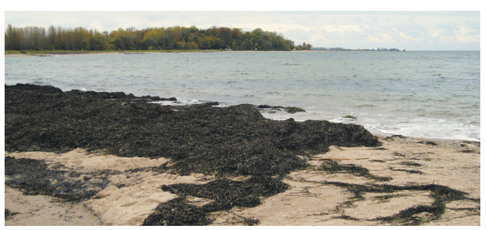
Seaweed washed up on a beach

www.climate-service-center.de/037947/index 0037947.html.en