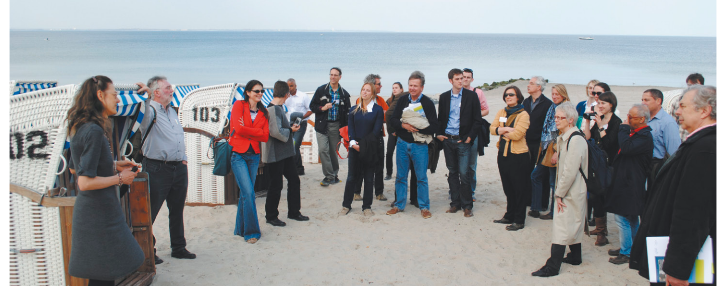
Group discussion during the excursion to Timmendorfer Strand

The workshop included an excursion to Timmendorfer Strand, where the participants gained extensive insight into the planning and implementation of the area's exemplary coastal protection concept. These measures are set apart by the participatory process that was used during decision making and preparation. Comprehensive inclusion of landscape architectural aspects was also part of the planning. For example, solid coastal protection structures like concrete walls were embedded in the natural dune landscape to make them unrecognizable.