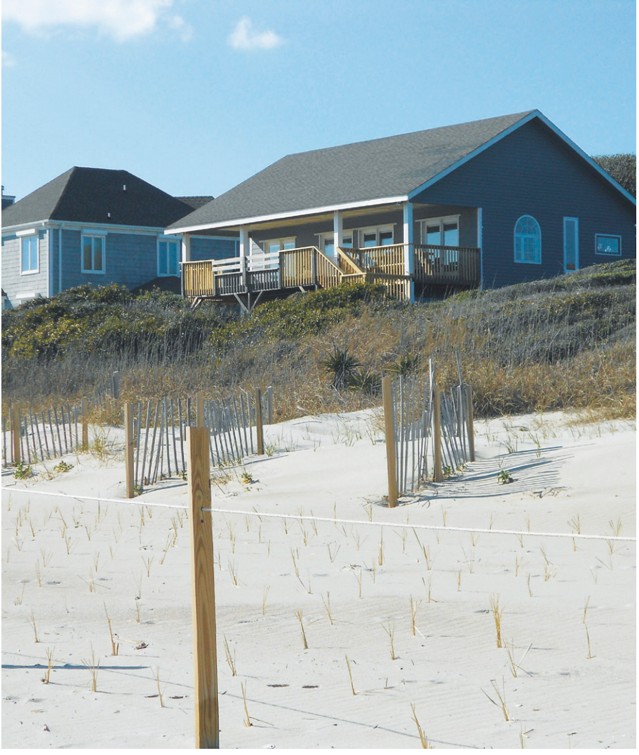
House built directly on a dune, Atlantic Beach peninsula, North Carolina

http://klimzug-radost.de/en/report18/contested-values