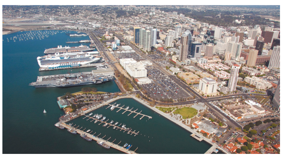
Harbor in San Diego, USA

http://klimzug-radost.de/en/report19/ internationale-beispiele-derklimaanpassung