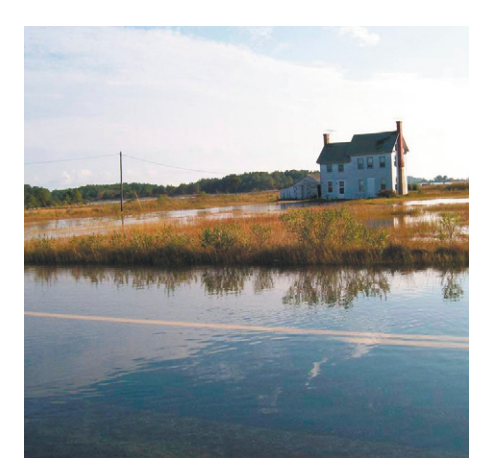
The yard surrounding a house in Dorchester County, Maryland is flooded during a spring high tide.

Experience from adaptation to climate change at community level shows that high levels of adaptive capacity are often present but are not used for adaptive action, and therefore communities remain vulnerable. A master's thesis performed in connection with the RADOST project looks at the socio-cultural construction of values and practices that influence risk perceptions and behavioral intentions in coastal management and adaptation to climate change in three states on the US mid-Atlantic coast. The study is based on a discourse analysis of three local newspapers, a literature review, and a survey among decision makers on coastal management in those states. The survey was carried out by the Nicolas School of the Environment at Duke University and Ecologic Institute during three workshops held in Annapolis (Maryland), Beaufort (North Carolina), and Charleston (South Carolina) in April 2012. This data is used to identify the influence of cultural differences on coastal zone management in the study area.