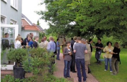
Lively exchange of views during the break

On 21 June 2011, an informational communication forum was dedicated to the increasing utilisation of the German Baltic Sea area and coast as well as the interaction of these various activities with the challenges of climate change and adaptation. The event took place in Neu Broderstorf near Rostock at the Institute of Applied Ecology (IfAÖ) as part of the project RADOST. Marine sand and gravel extraction, the fishing industry and future land space development in the coastal waters of Mecklenburg-Western Pomerania stood at the forefront of the workshop. One point raised during the lively discussions between the 35 participants was the limitations on the influence of contributions from sectoral plan-