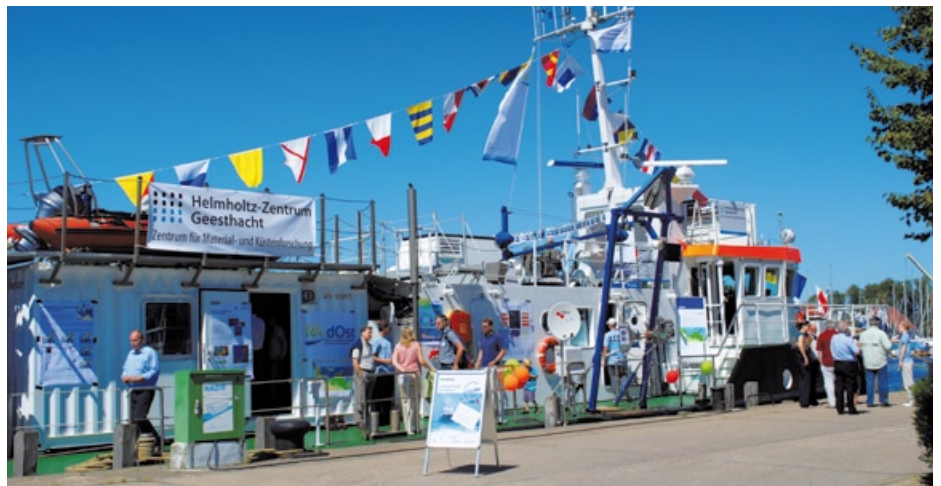
„Open Ship“ in the harbor Greifswald/Wiek

The Open-Ship Day, part of this year's "Research at Anchor" tour of the Helmholtz-Zentrum Geesthacht Center for Material and Coastal Research (HZG), was carried out in cooperation with RADOST and was dedicated to the topic of climate change adaptation. ...to be continued on page 3