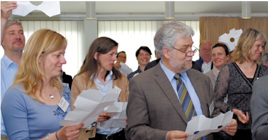
Proof of the ambiguity of communication: the same instructions lead to different patterns.