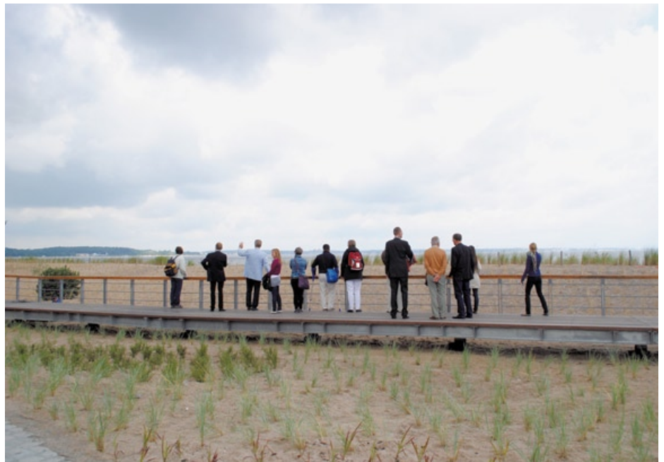
Field trip to observe coastal defense measures (Scharbeutz)