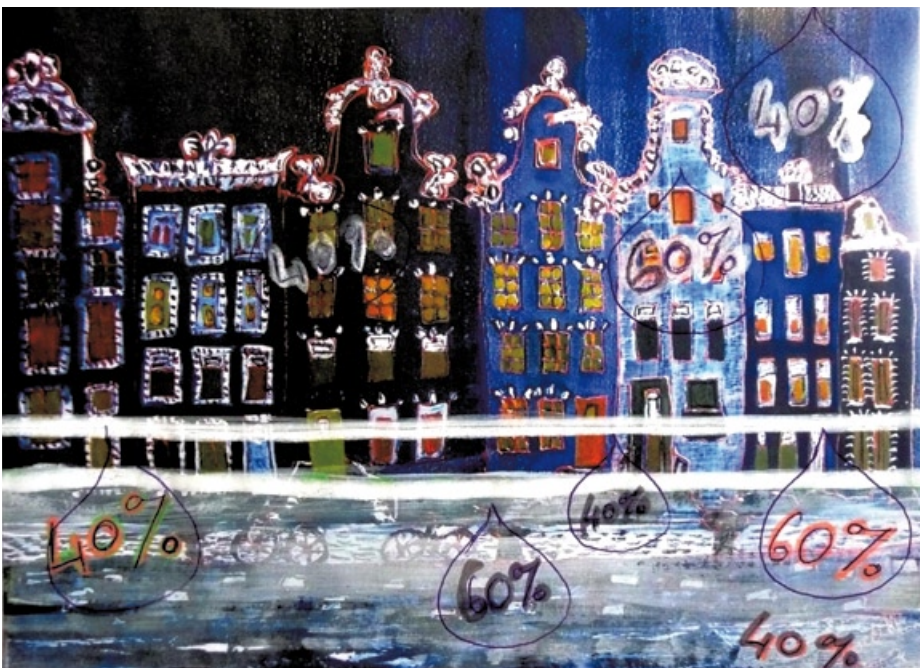
Visual impression of the River Side Chat by the French artist Pascall Vernot

A lively discussion ensued. Topics addressed included the need for the scientific community to communicate climate change science in a clear and responsible manner that still recognizes the array of other global challenges. Differing opinions were also raised on the adaptation challenge posed by 1-2 m of sea level rise, as well as the timeline over which such adaptation should be implemented. At the conclusion of the chat, the group agreed that, in light of the post-normal situation of climate change, the interplay between politics and science must change. Policy makers must acknowledge the inadequacy of current political timeframes. It was agreed that science is imbedded in specific cultural contexts, and so the array of perspectives involved mean that climate change adaptation must be undertaken in regionally sensitive manners.