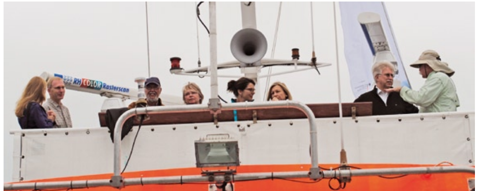
Aboard the ship, political decision-makers could exchange ideas with planners and scientists from Germany, Sweden and the US on the issue of climate adaptation.